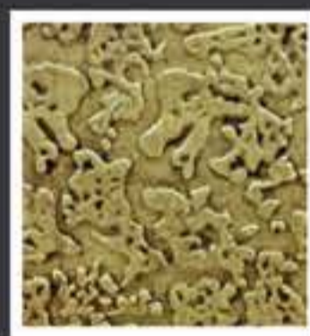
V Lake & Hill